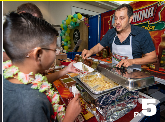
Choice Partners Nutrition Expo