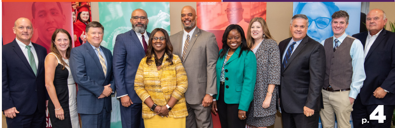
HCDE Hosts 8 Area Superintendents