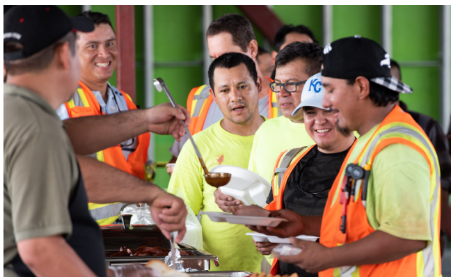
ABS West construction workers enjoy a meal to celebrate the half-point mark in the construction of the new school.