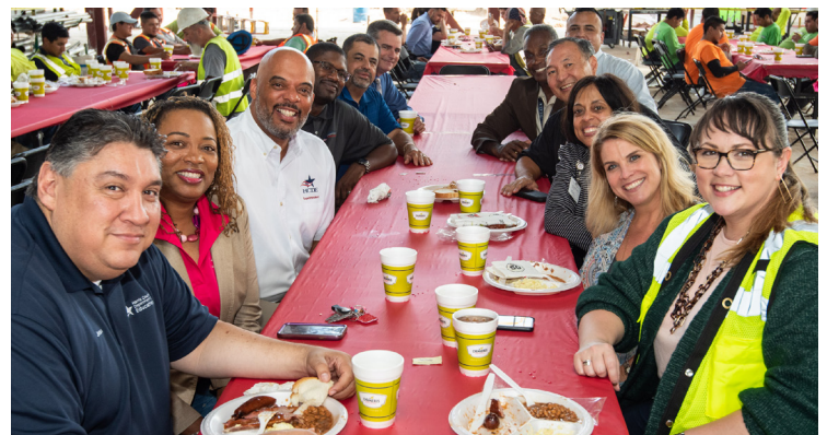
HCDE Staff join and thank construction workers for their hard work.