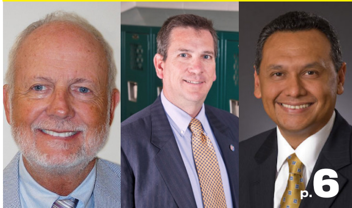
School Safety Summit Enlists 3 Dynamic Safety Experts