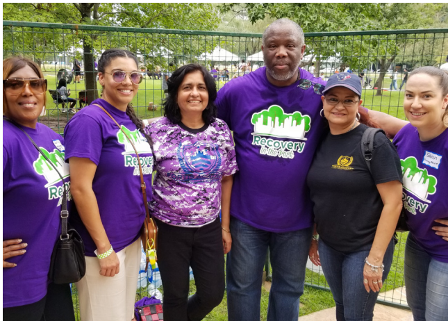
Fortis students and staff participated in Recovery in the Park Sept. 28 at Discovery Green Park in Houston. The event in its fifth year celebrates recovery communities and alternative peer groups. Sober teens joined to network and socialize with games and food.